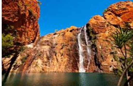
Miri Miri Falls on El Questro Station near Kununurra